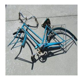
Scrap Metal metal piping and items made of metal such as grills and treadmills