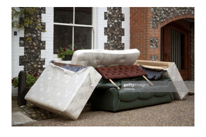
Upholstered Furniture, Mattress/Boxspring, Wood Furniture