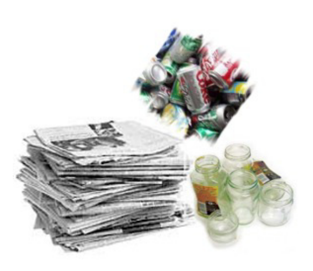
All Recyclables paper, aluminum, metal, glass and plastic containers, and cardboard and books