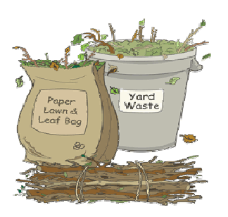
Yard waste & Brush